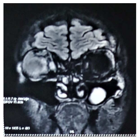
[ RE = Right Eye, LE = Left Eye]

In left eye, the best corrected visual acuity (BCVA) was 6/24 on Snellen's chart and